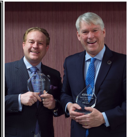
Award Winning Salesmen, Marketers & Entrepreneurs

Issue 314 ... November, 2023 Subscription price $49.00